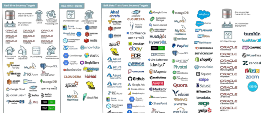
Figure 1: OCI GoldenGate supports 100s of connectors across clouds, databases, technologies, and application services.

OCI GoldenGate connects to 100s of databases, data stores, messaging services, applications, internet business services, and more. See the GoldenGate and Data Transforms documentation for the latest connectors.